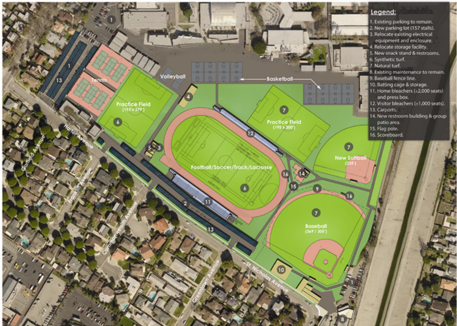
Site Plan - Scheme 10