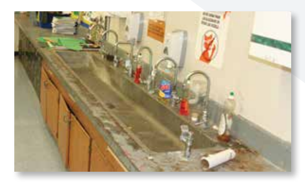
A Culver City High School science lab. Many science labs have not been updated since the 1950's and are badly in need of repairs.